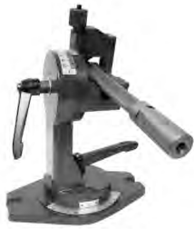
DM-41 Manual Regrind Fixture